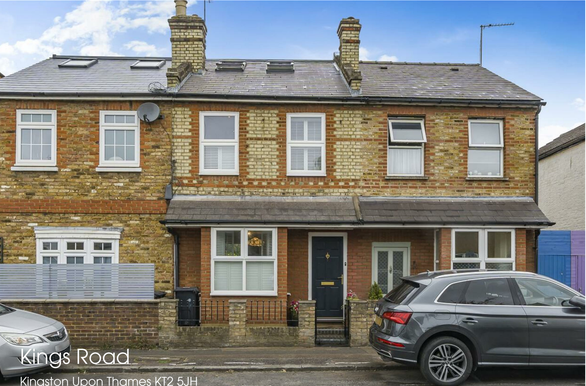
Kings Road Kingston Upon Thames KT2 5JH